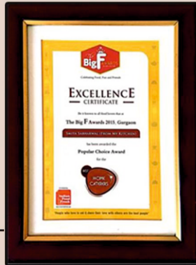
Big F Popular Choice Award