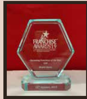
Upcoming Franchisor of the year 2019