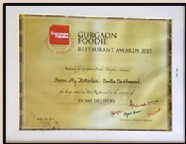
Gurgaon Foodie Award 2015 & 2016