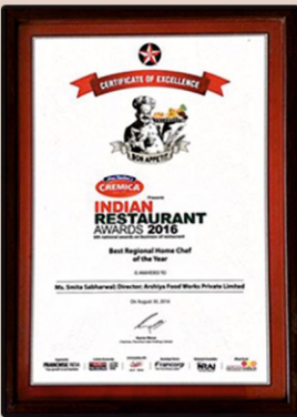
Indian Restaurant Award 2016