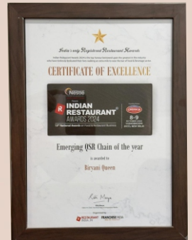
Emerging QSR Brand of the year 2024